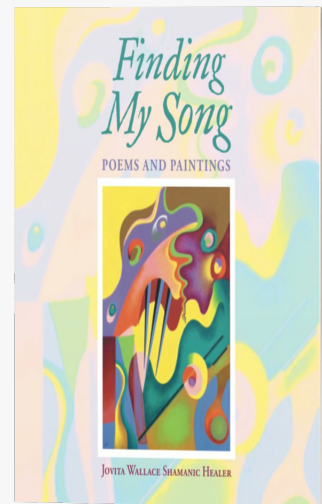
Finding My Song: Poems and Paintings