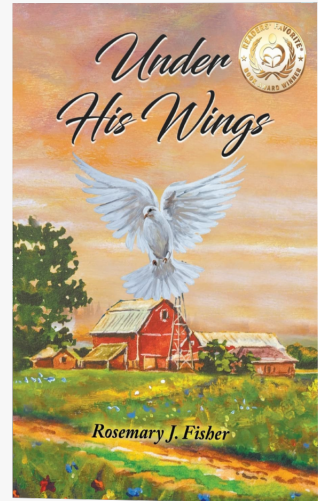
Under His Wings

the challenges he faces at home, especially his father's terminal illness. Coop becomes entangled