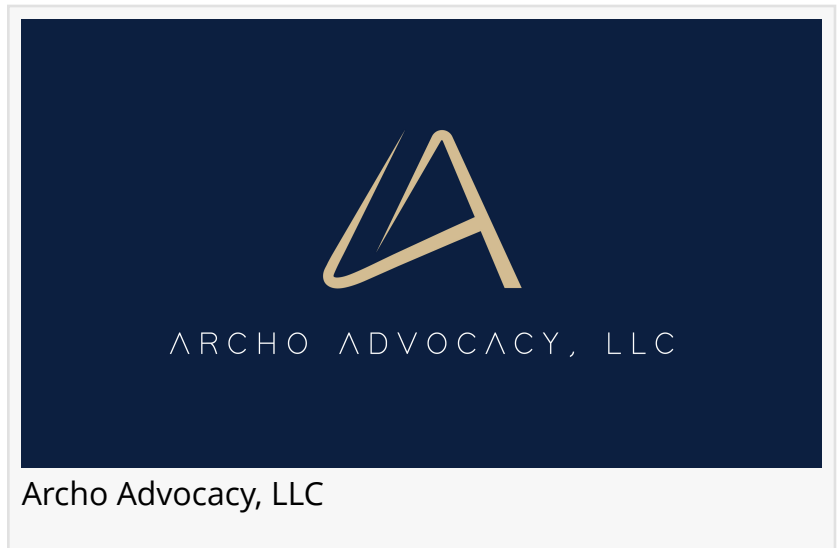
Archo Advocacy, LLC

10. Travele: Highlighted for their exemplary policy discourse opportunities and government outreach guidance.