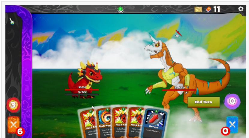
Dreamians: Card Battle fight scene.

There are over a hundred cards available that can be used to attack enemies, defend oneself,