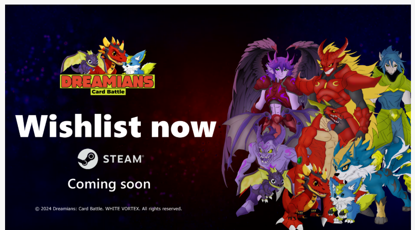
Dreamians: Card Battle wishlist image