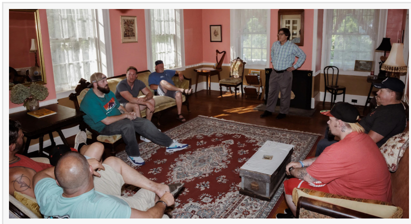
Group Therapy Session at Mountain View Retreat

How Mountain View Retreat's PHP Program Stands Out