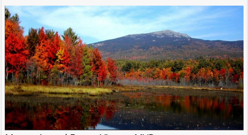
Mountain and Forest View at MVR