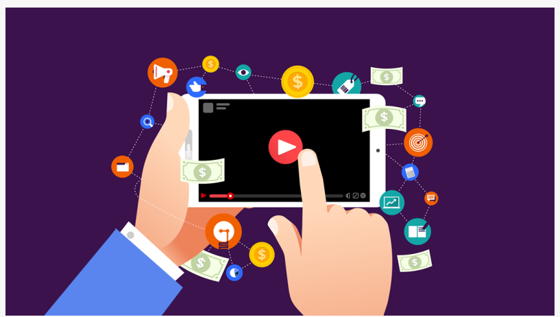
Video Marketing for Lawyers

Business Solutions Marketing Group is a leading marketing agency specializing in legal marketing. BSMG has a proven track record of helping lawyers achieve their marketing goals. For more information, please visit https://businesssolutionsmarketinggroup.com/video-marketing-programs-for-lawyers/ .