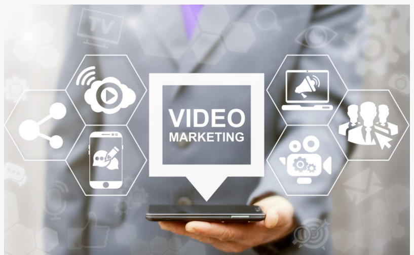
Video Marketing for Attorneys