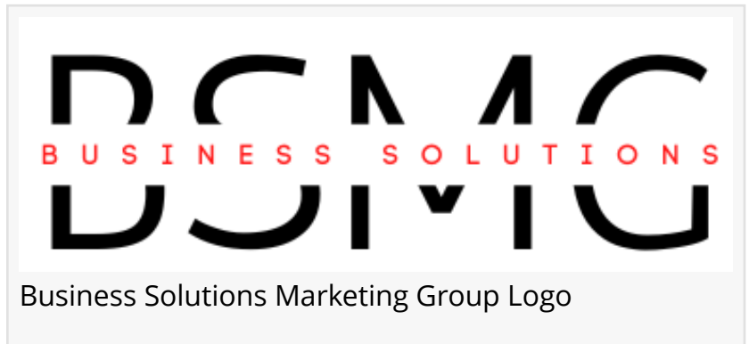
Business Solutions Marketing Group Logo

MECHANICSBURG, PA, USA, July 29, 2024 /EINPresswire.com/ -- Business Solutions Marketing Group (BSMG), a leading marketing agency specializing in legal marketing, today announced the launch of its new Video Marketing Programs for Lawyers. These programs are designed to help lawyers leverage the power of video to capture and retain audience attention, build trust and authenticity, improve SEO, and ultimately drive conversions.