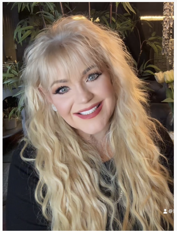
Owner of Business Solutions Marketing Group

This press release can be viewed online at: https://www.einpresswire.com/article/731275852