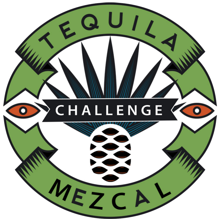
Tequila Mezcal Challenge logo

The Tequila Mezcal Challenge welcomes entries from artisanal producers (5,000 bottles or less) and commercial bottlers. The judging team comprises some of the world's most seasoned