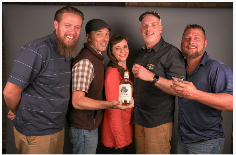
Tequila Mezcal Judges with 2023 Best of Show-1st Place Winner

This press release can be viewed online at: https://www.einpresswire.com/article/731365669