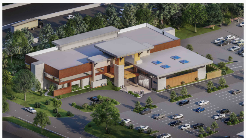
After extensive renovations the existing office building will become a destination Spa.

The office building was formerly an educational use and will, after extensive renovations become iSpa Haven, a high-end automated spa. The 2.36 acre property has 283' frontage on I-95 with 107,900 ADT average daily traffic.