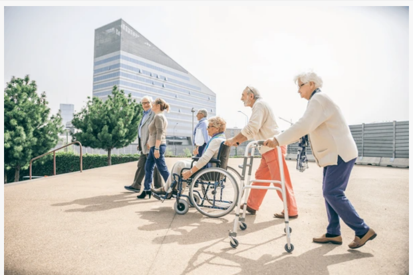
Happy and independent seniors enjoying life to the fullest with innovating mobility aid solutions

DAVIE, FL, UNITED STATES, July 29, 2024 /EINPresswire.com/ -- Top Medical Mobility, A mobility solution expert dealer and provider, is excited to announce the biggest mobility aids for 2024. In partnership with industry giants like Invacare, Drive, McKesson and more, this year is a big step forward for wheelchairs, 4-wheel mobility scooters and lightweight rollators for sale .