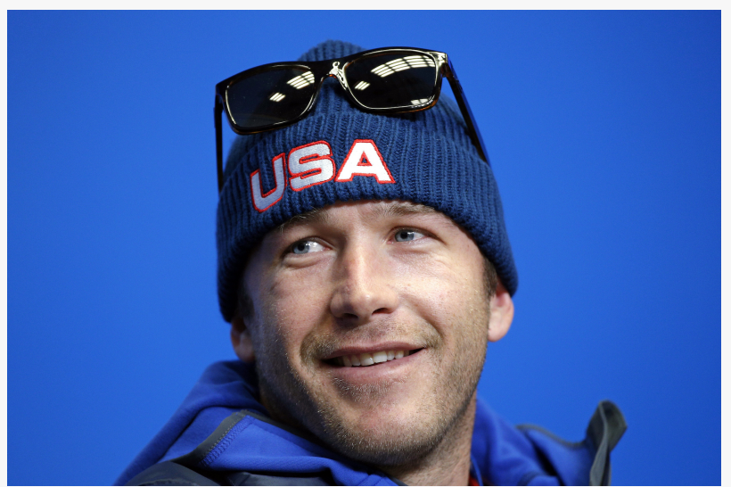
Alpine Ski Olympian Bode Miller