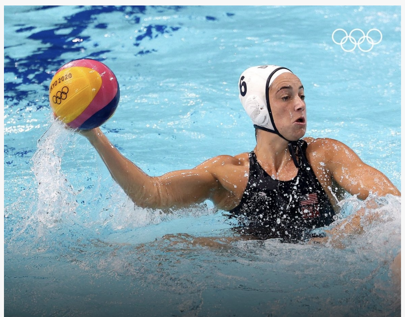
USA Olympics Women's Water Polo team captain Maggie Steffens

Now in its 23rd year, the ICL Foundation is dedicated to shaping a future where flexible, world-class education becomes economically accessible to all high-achieving students. For students, based on need and merit, the Impact Learning Model™ enables high performing students to emerge as leaders within the global community. This combines elite accredited courses,