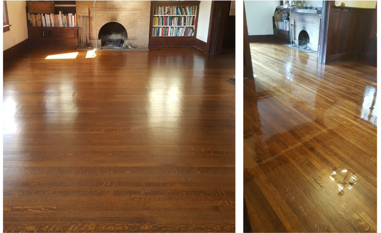
Hardwood Refinishing in Los Angeles