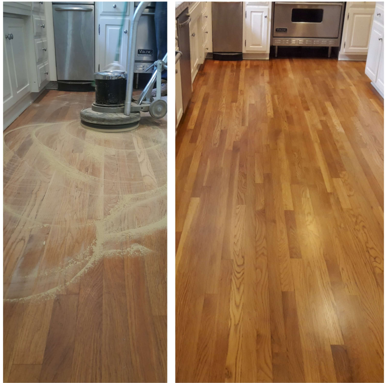
Hardwood Refinishing in Beverly Hills

/EINPresswire.com/ -- Beverly Hills, renowned for its luxury, elegance, and sophisticated lifestyle, is home to some of the most exquisite residences in the world. A key element that contributes to the charm and beauty of these homes is the presence of hardwood flooring. Over time, even the finest hardwood floors can lose their luster due to wear and tear. The process of hardwood refinishing is essential in restoring these floors to their original grandeur. This detailed exploration of Beverly Hills hardwood refinishing delves into the techniques, benefits, and importance of maintaining and enhancing hardwood floors in this prestigious area.