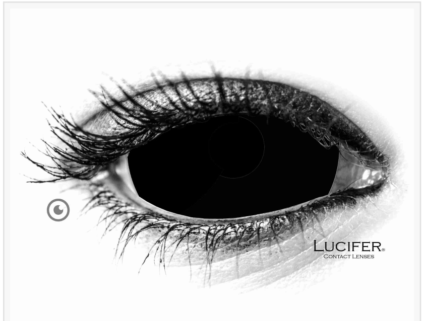
Black Sclera - www.sclera-lenses.com

The new black contact lens models are crafted from the highest quality materials, ensuring comfort and safety for daily wear. Available in various prescription strengths, they cater to individuals with vision impairments. Customers can now enjoy the benefits of clear vision while