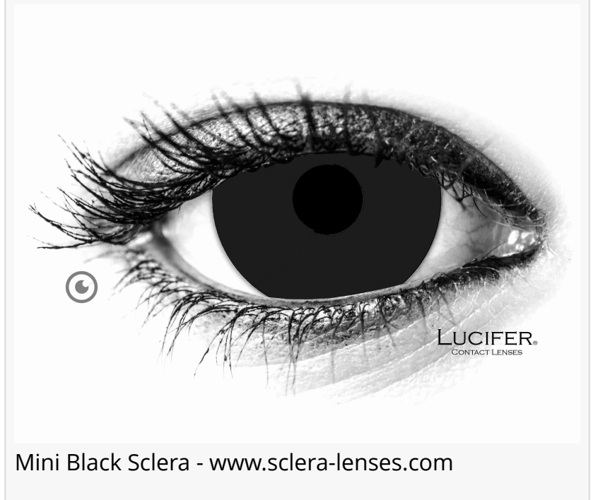
Mini Black Sclera - www.sclera-lenses.com

Customers can now enjoy the benefits of clear vision while