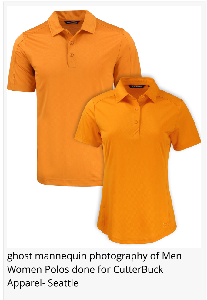
ghost mannequin photography of Men Women Polos done for CutterBuck Apparel- Seattle

EtherArts Product Photography Miami achieves low-cost, high-quality Amazon product photography through a combination of efficient workflows, advanced technology, cost management strategies, effective client collaboration, and automation. By focusing on these areas, they produce appealing product images that enhance affordability and drive high sales on