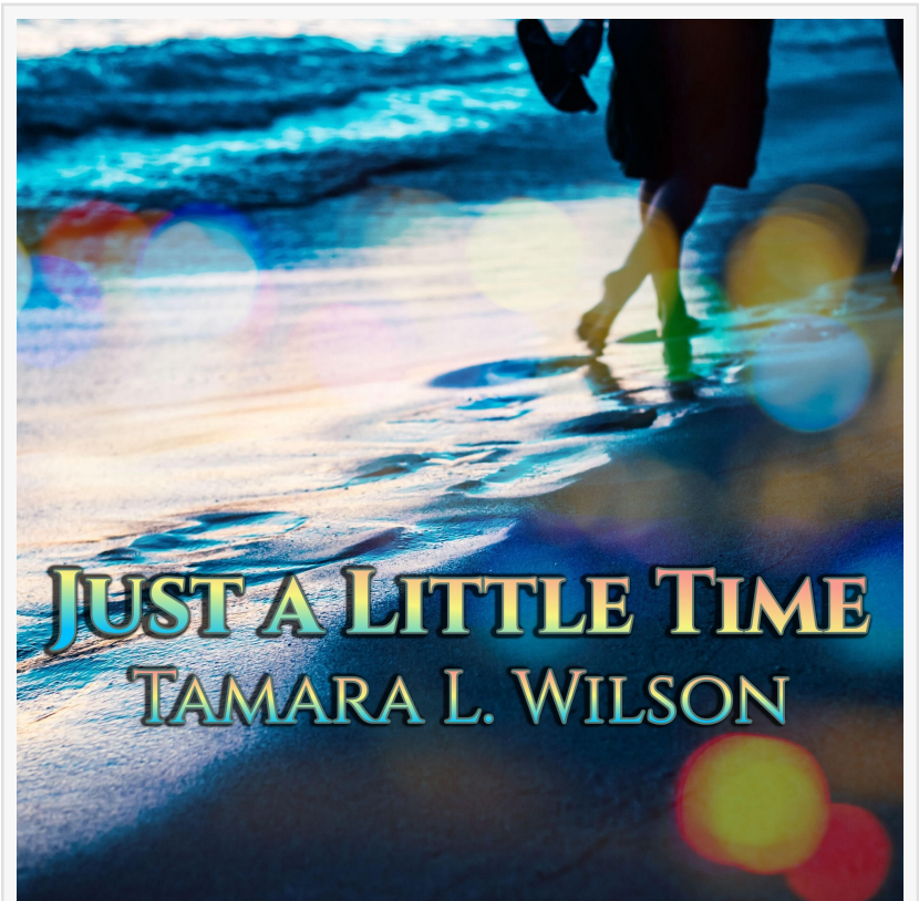
'Just a Little Time'