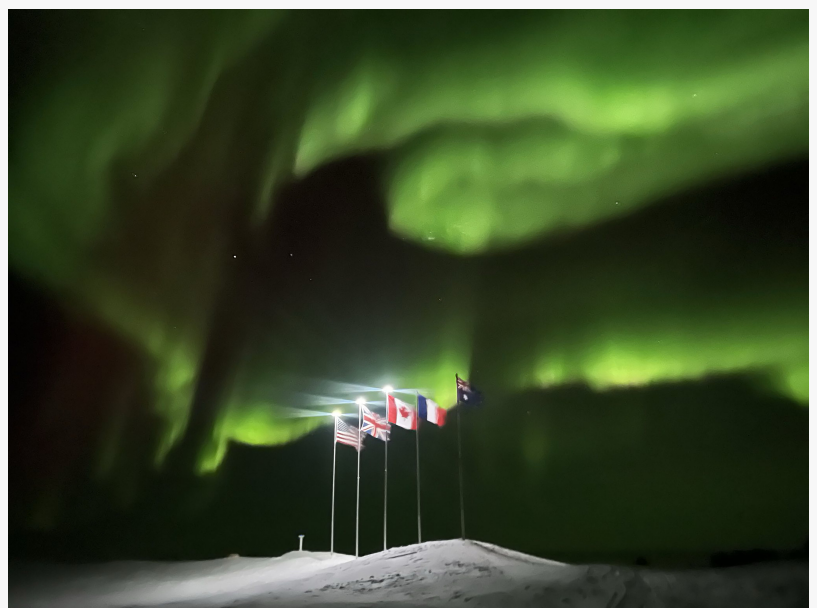
Representatives from the United States, United Kingdom, Canada, France and Australia participated in Operation Ice Camp 2024, headquartered at Ice Camp Whale on the Arctic Ocean.

Centered on its temporary command center Ice Camp Whale, Operation Ice Camp 2024 involved more than 200 participants from across the U.S. armed forces and the military services of partner nations, including representatives from the Royal Canadian Air Force, Royal Canadian