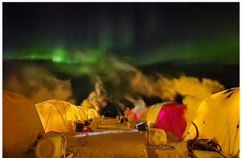
The Northern Lights appear over Ice Camp Whale during Operation Ice Camp 2024.