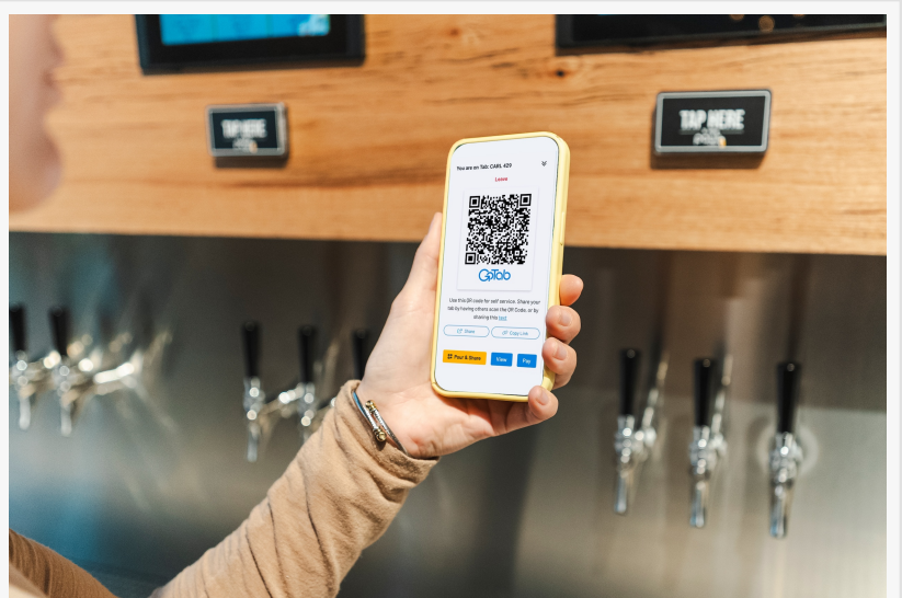
Web App QR Code