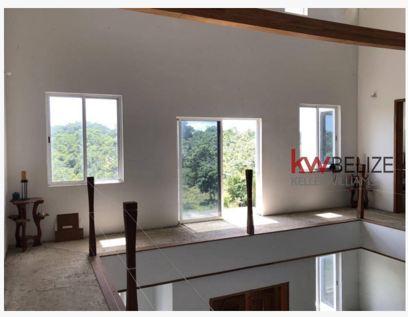
Coastal home upstairs

room. The ornately carved hardwood, main entrance door at the front of the house opens into the lobby (approx. 625 sq. ft.), where a grand staircase rises up to the second floor to reach carved hardwood bedroom doors each depicting a wild animal common to the property.