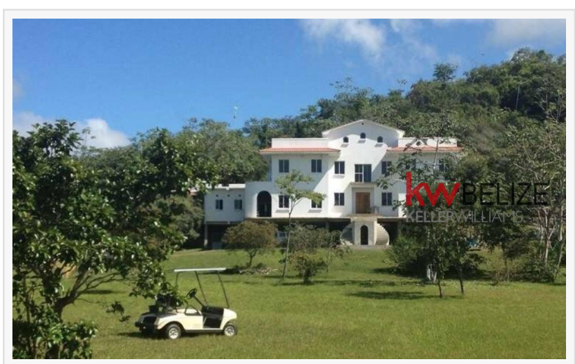
Coastal Home front view

First floor comprises two large halls (approx. 800 sq. ft. each) either side of the lobby and connected by wide arched openings. Each hall has a 10 ft wide covered balcony either side. There are three planned washrooms on this floor, a swimming pool changing room and a fair sized utility