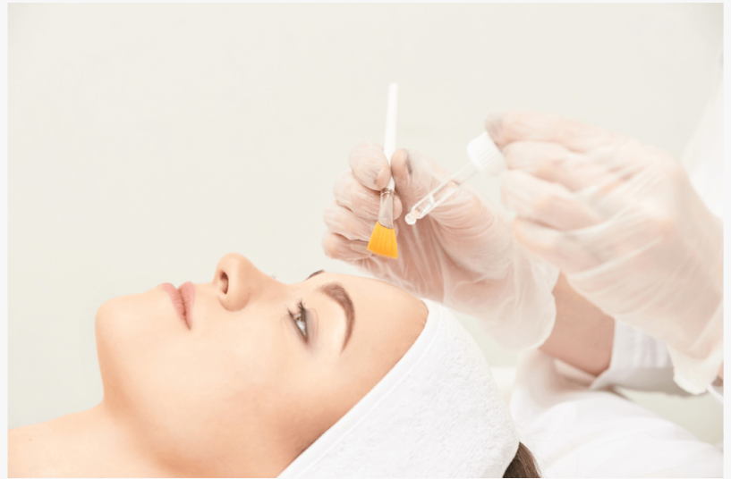
call of beauty med spa encinitas