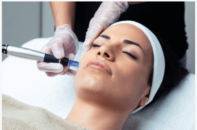
medical spa encinitas

Call of Beauty Med Spa Encinitas has become a trusted name in the community for offering state-of-the-art aesthetic treatments. The experienced team of licensed professionals is dedicated to helping clients achieve their aesthetic goals through personalized treatment plans. Each treatment is tailored to address specific skin and body concerns, ensuring optimal results and client satisfaction.