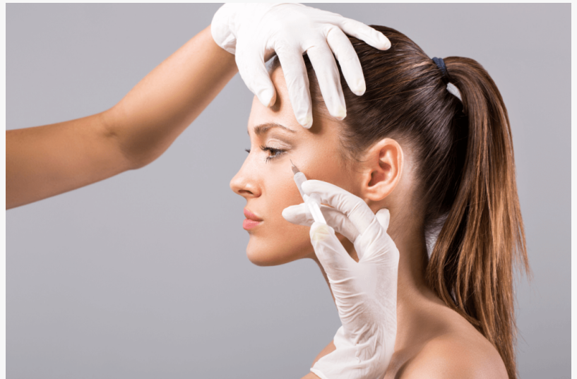
encinitas california med spa

One of the cornerstone treatments at Call of Beauty Med Spa is Botox. Known for its effectiveness in reducing the appearance of fine lines and wrinkles, Botox is a non-invasive procedure that provides noticeable results with minimal downtime. The skilled practitioners at