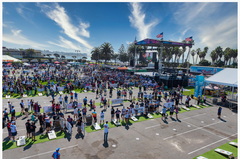
Overview of the Throw Down Cornhole Festival at Ventura County Fairgrounds

/EINPresswire.com/ -- The Throwdown Cornhole Festival returns to beachside Ventura County Fairgrounds on August 23 – 25. Celebrating its 14th year, the tournament draws the sport's best players from the lower 48 plus Hawaii as well as teams from Canada, Mexico, England, Venezuela, and Sweden. With 1,088 teams competing for over $350,000 in cash prizes The Throw Down Cornhole Festival has grown to be the world's largest and most popular cornhole tournament.