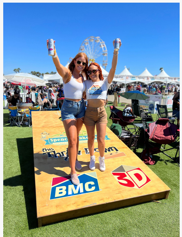
Two women attendees celebrating at the Throw Down Cornhole Festival