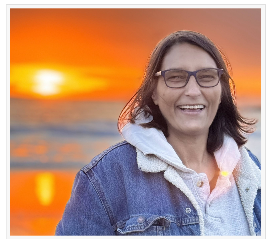
ResilientAF Press - Because we are ALL ResilientAF!

minded about LGBTQ issues, this book is a must-read!" – Readers' Favorite (5 stars)