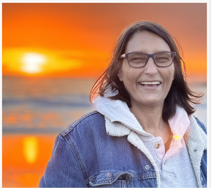
ResilientAF Press - Because we are ALL ResilientAF!

• "A captivating account of a troubled childhood told by a naturally remarkable narrator, the memoir is an insightful true story that will inspire anyone who has been through similar situations. The story of Not My Circus is one of perseverance and resilience in the face of hardship. For those who enjoy inspiring memoirs and are open-minded about LGBTQ issues, this book is a must-read!" – Readers' Favorite (5 stars)