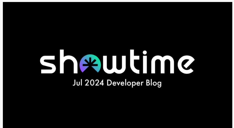
Showtime Jul 2024 Developer Blog