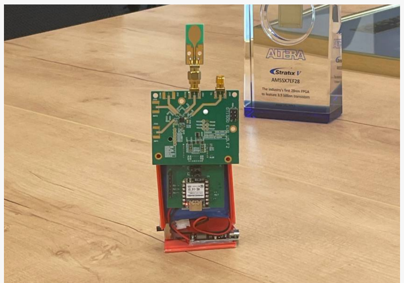
UWB chip for device-to-device connections

The update also sheds light on the improvements made to the Seed Vault Wallet, a crucial component of the smartwatch's security system. The wallet now supports SPL token transactions