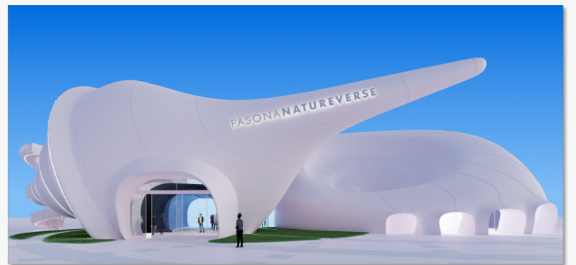
Expo 2025 pavilion "PASONA NATUREVERSE" exterior concept image