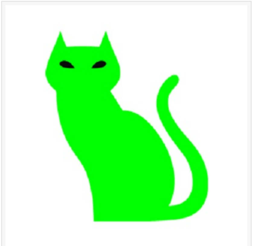
Green Cat Consulting

Green Cat Consulting stands out in the competitive market of website design in Tyler, TX, by leveraging years of experience and a deep understanding of the local business environment. The team at Green Cat Consulting recognizes that the digital marketing strategies that work in Tyler are distinct from those used in larger cities like Seattle or New York. The company's approach is grounded in the specific needs and preferences of East Texas businesses, ensuring that each web design project is not only visually stunning but also highly functional and effective in driving business growth.