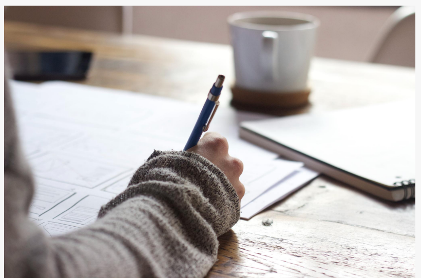
tyler web design

While Green Cat Consulting is firmly rooted in the Tyler community, the company's expertise extends beyond local borders. The quality of work produced by Green Cat Consulting has attracted clients from