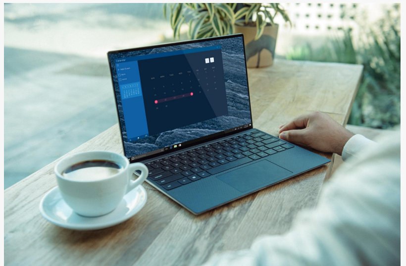
custom web design tyler tx