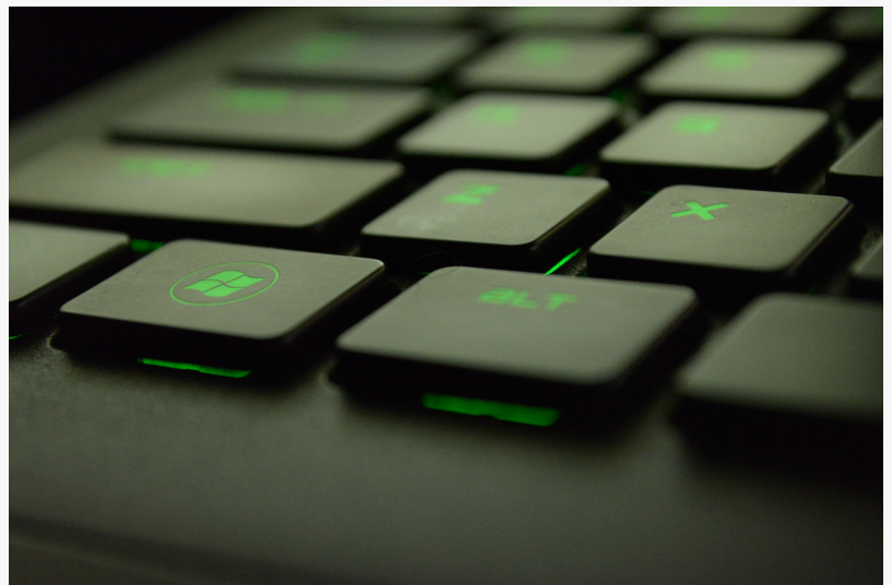
digital marketing tyler tx