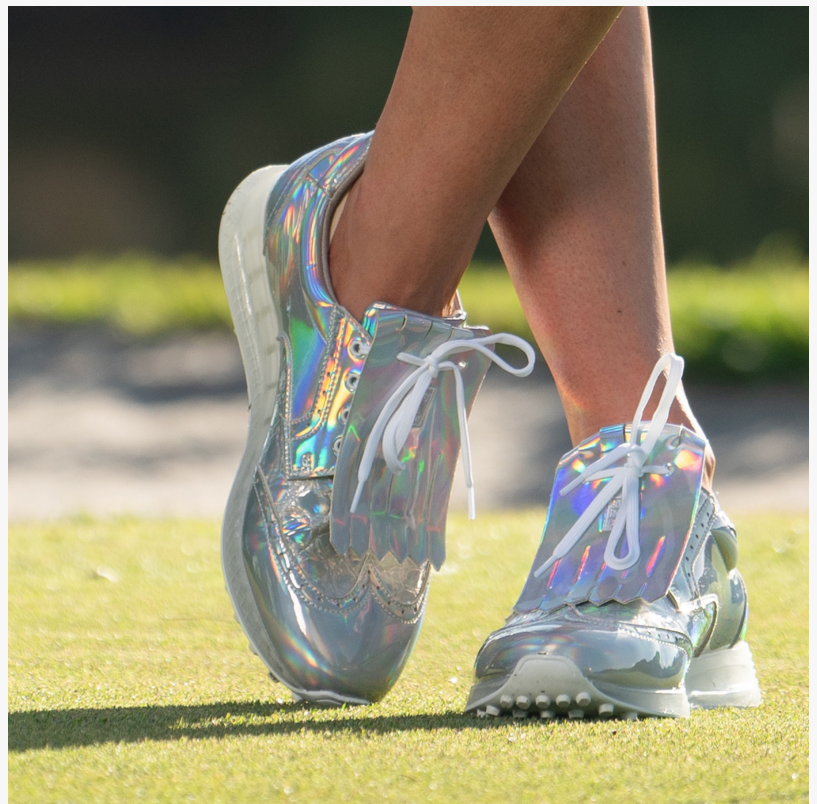
The LIL Bellezza is packed with a blend of stylish and functional features to provide a standout look

Offered in limited quantities across North America and Europe, the standout LIL Bellezza style has seen two of the golf industry's most fashion-forward brands work in harmony to develop a supremely captivating women's golf shoe that demands attention from every angle.