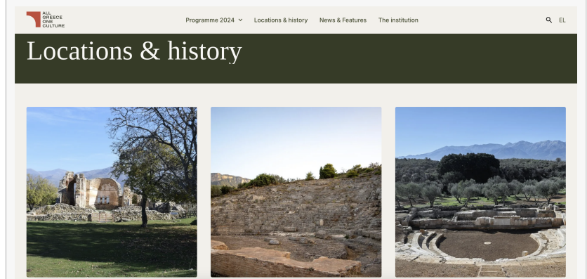
All of Greece One Culture Locations Page