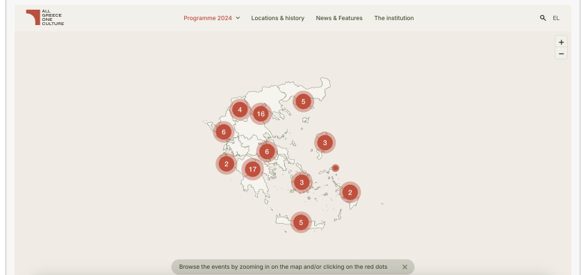
All of Greece One Culture Interactive Map