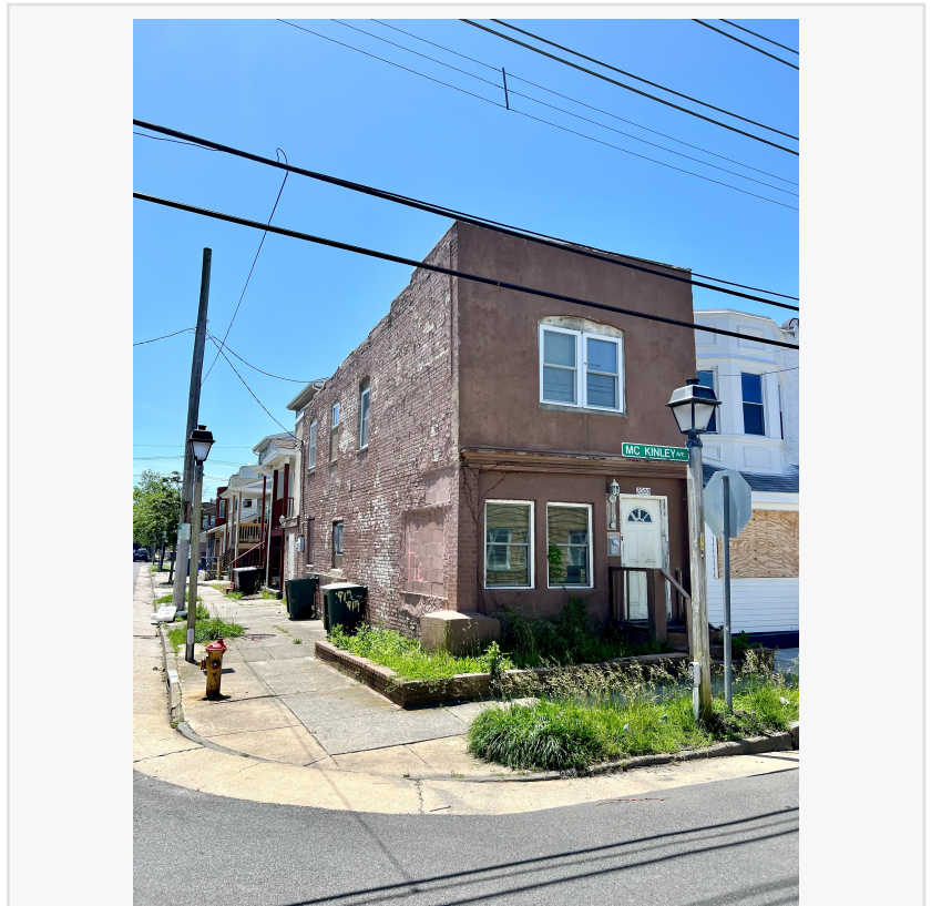
2000 McKinley Ave