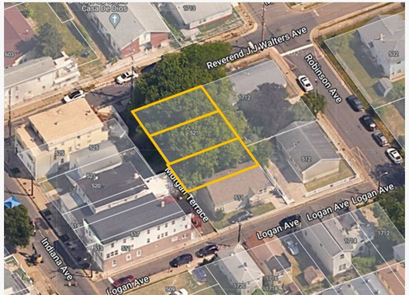
Morgan Terrace - 3 Lots