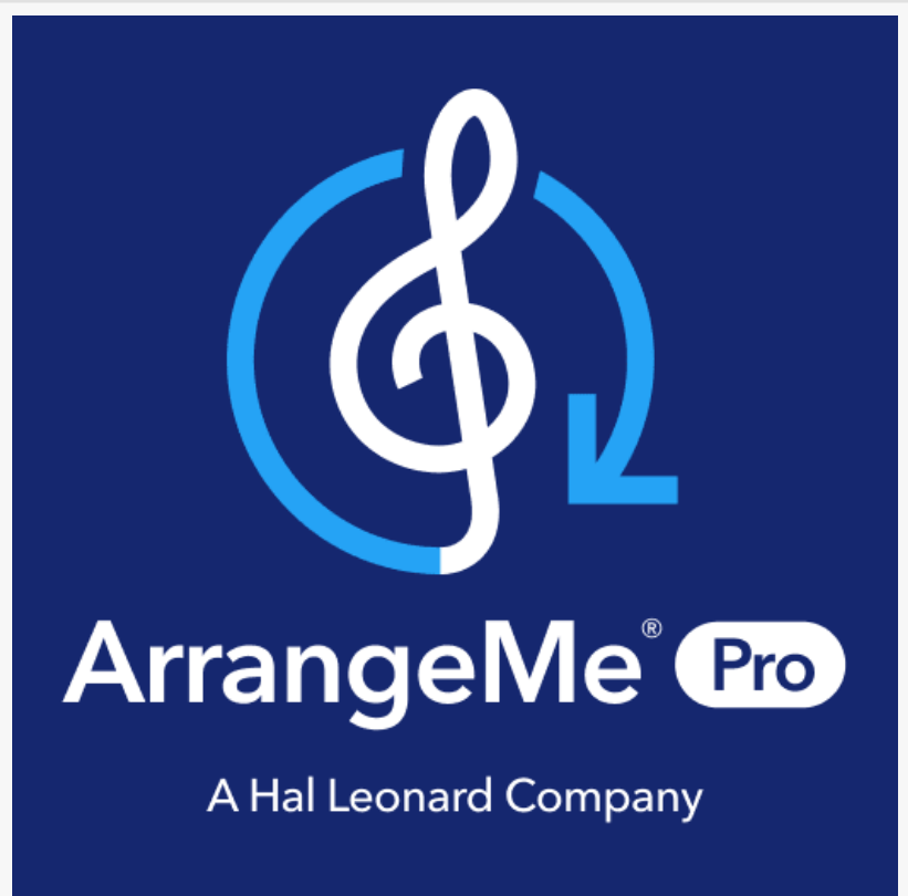
ArrangeMe Pro Logo PNG

"We are thrilled to announce ArrangeMe Pro, which offers premium-level features and an enhanced account experience that will allow all arrangers and composers to take their self-publishing to the next level," says