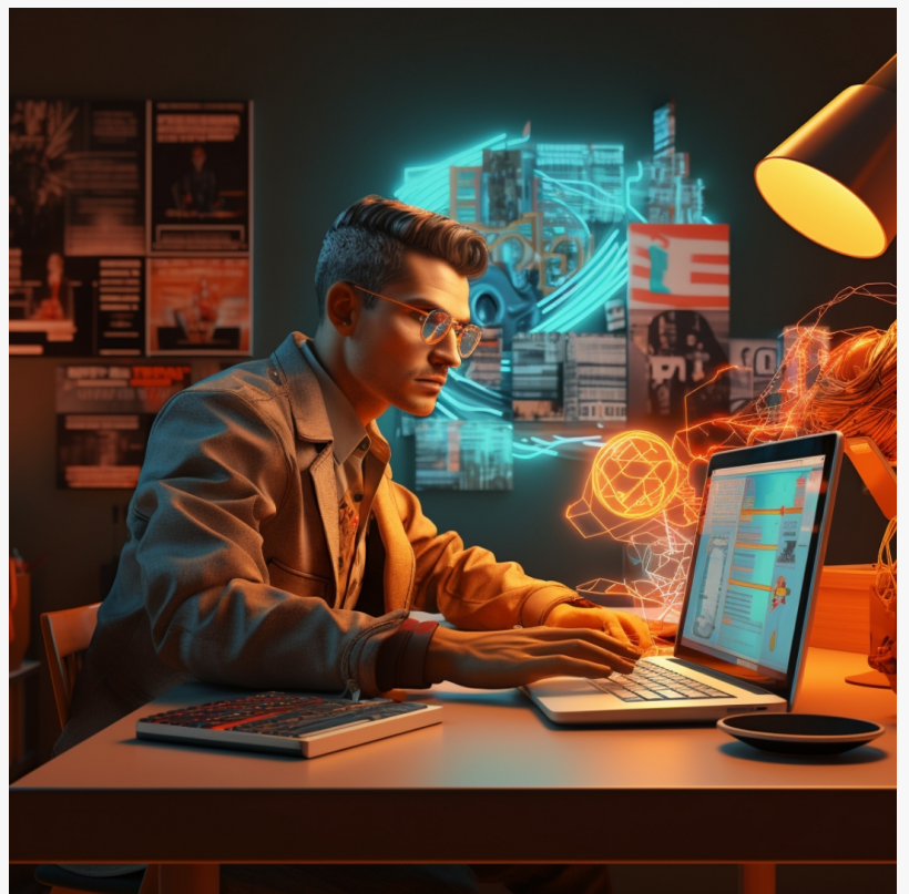
Lounge Lizard Enhances Digital Interactions with Expertise in User Experience (U/X)