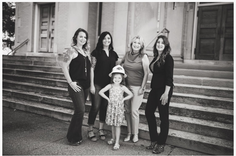
Justified M2 Solutions Certified as a National Women Business Enterprise (WBE)

dedication to quality, safety, and customer satisfaction has earned it a stellar reputation among its clients and peers. With the WBE certification, Justified M2 Solutions aims to enhance its competitive edge, foster new business opportunities, and contribute to the advancement of women in these male-dominated industries. The company is committed to upholding the values of diversity and inclusion, which are integral to its mission and operational philosophy.