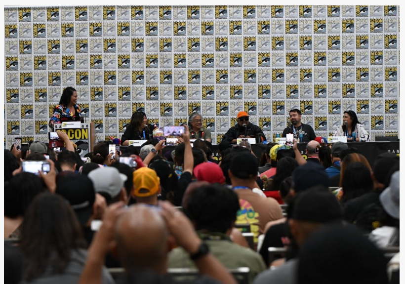
Halo Halo x SDCC Panel

/EINPresswire.com/ -- HALO HALO Corp proudly launches its breakthrough mobile platform, designed by creatives for creatives and their fans, to redefine digital comics, entertainment, and advertising with innovative technology. Inspired by the vibrant mix of the beloved Filipino dessert, HALO HALO embodies inclusivity and spotlights the exceptional talent of Filipino creatives who have been instrumental to major studios like Marvel, DC, Image, TOEI Animation, Disney, and Cartoon Network. With this celebration of Filipino creativity, we lay the groundwork for our broader mission: to unite and enhance creative voices globally.