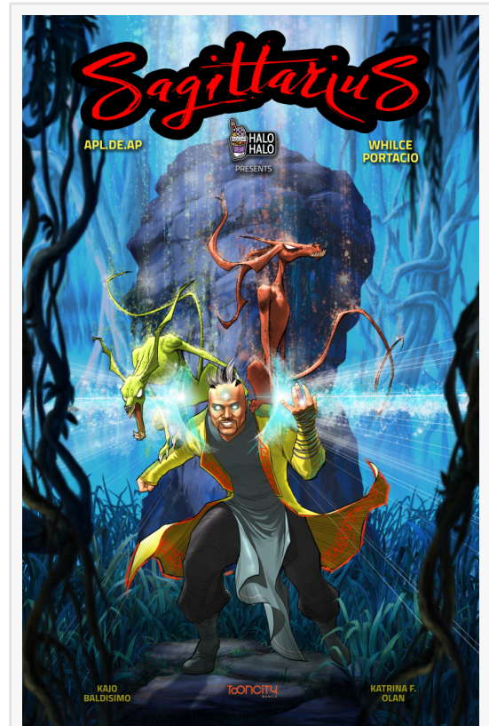
APL.DE.AP Sagittarius by Whilce Portacio

We harness the rich cultural heritage and exceptional talent of Filipino artists, serving as a foundation for future growth. Our approach not only showcases our commitment to celebrating diverse narratives but also strategically develops a scalable platform, positioning us to amplify and elevate creative voices globally. Our creative team includes renowned artists from Marvel, DC, Image, and the animation industry,