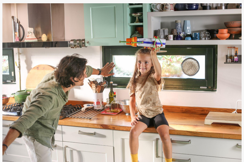
21st Century Skills

#Eco-Friendly Materials: Made from washable recycled plastics for sustainability and practicality.