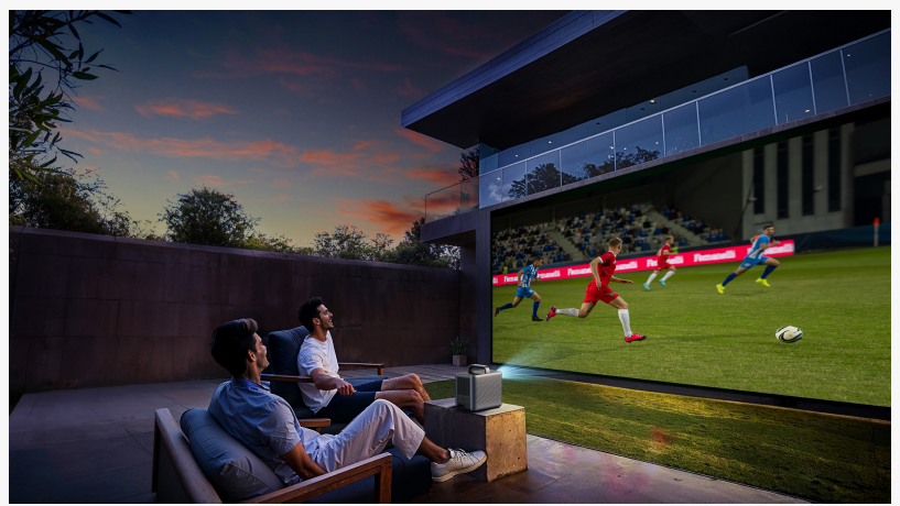
Nebula Cosmos Laser 4K SE - Backyard Movie Projector

The Capsule Air, standing only 5.51" tall and weighing only 22.93oz, is the smallest and most portable GTV projector on the market. Continuing with the brand's soda-can design, while standing less than one inch taller than a can of soda, allows the projector to be effortlessly carried on-the-go. Additionally, the Capsule Air also provides up to 2 hours of playtime with its built-in 34Wh battery. However, equipped with USB-C charging, the Capsule Air can easily be recharged using a PD-equipped power bank or wall charger.