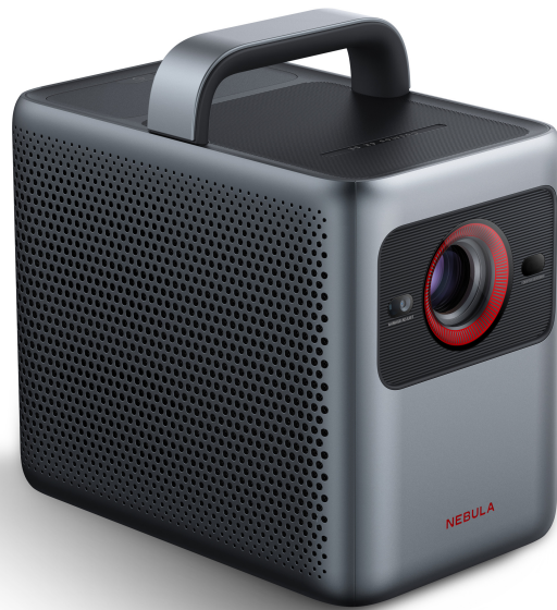
Nebula Cosmos Laser 4K - Product Photo