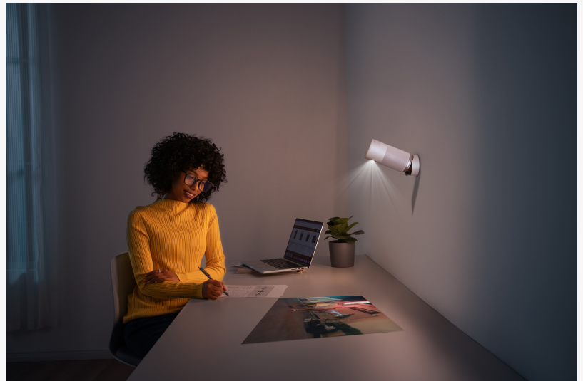
Nebula Capsule Air Mounted On Wall - Projects On Desk

The Cosmos 4K SE features 1,800 ANSI Lumens with 4K UHD resolution and is further enhanced by the addition of Dolby Vision® and the NebulaMaster™ image engine, ensuring a portable cinematic experience for users at home with an ergonomically designed handle.