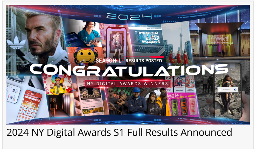
2024 NY Digital Awards S1 Full Results Announced

this award program honors outstanding achievements in a variety of digital realms, recognizing the finest minds in digital creation on both local brilliance and international achievements.