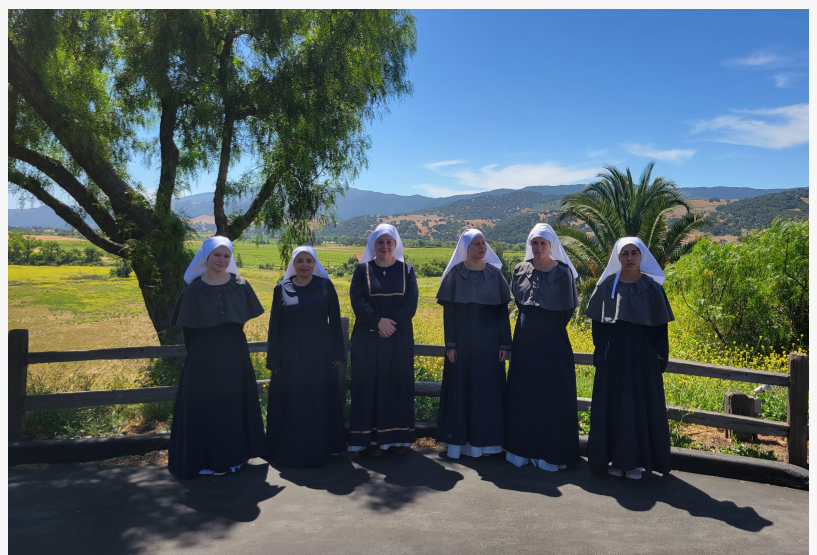
Santa Barbara County

This press release can be viewed online at: https://www.einpresswire.com/article/732219442