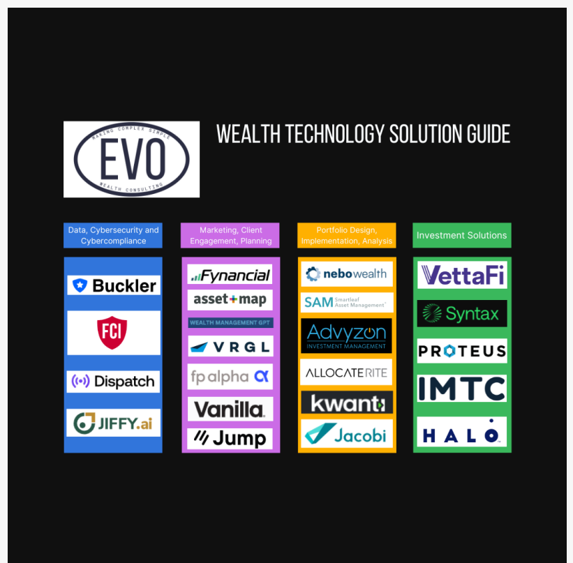
EVO Has Partnered with 22 Leading Wealth Technology Solutions Across the Technology Stack