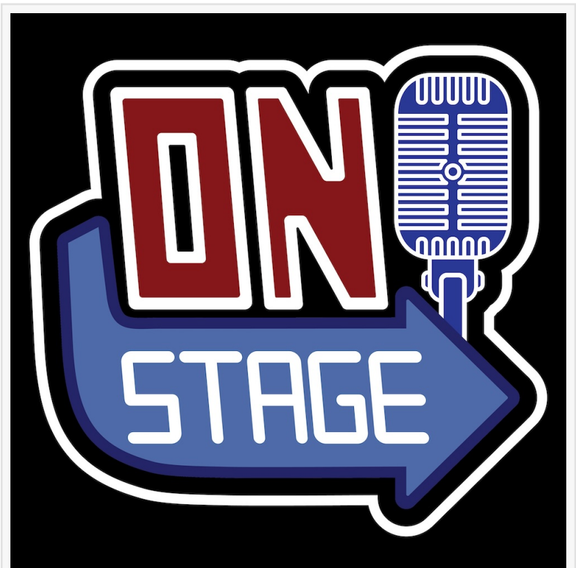
OnStage App Icon

performances. Future plans for the VAS system will include a platform for performers to get tips and donations from their fans and for some the ability to sell tickets to exclusive shows.