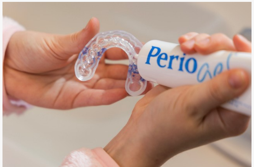
Easy Perio Gel Application for Perio Tray Delivery Deep Below Your Gums