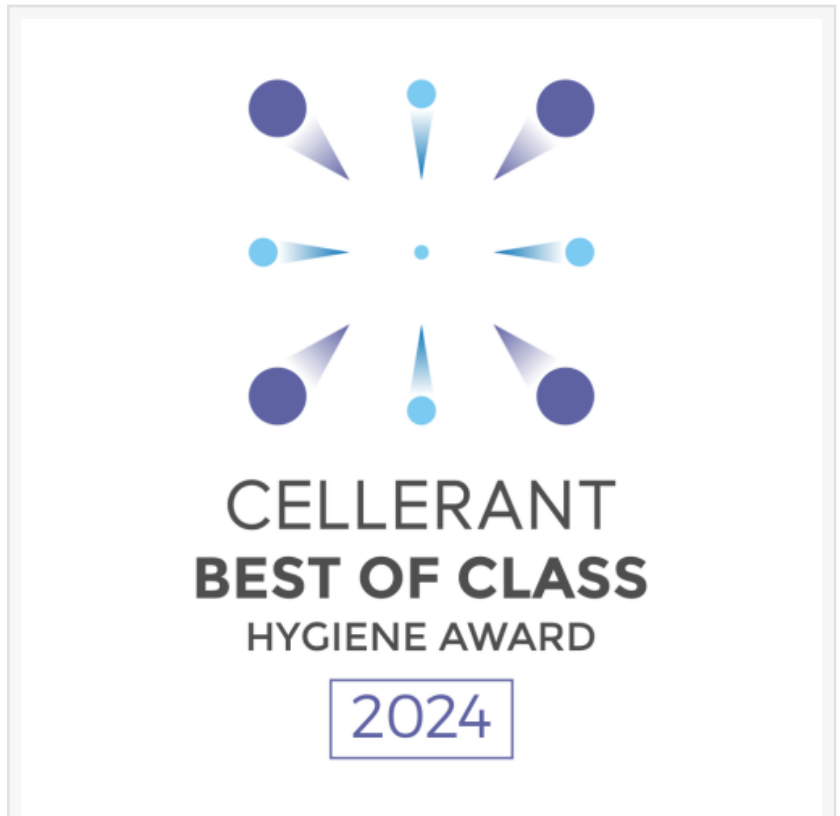
Cellerant Best in Class Hygiene Awarded to Perio Protect