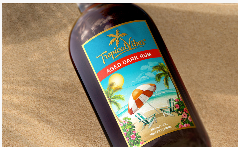
Tropical Vibes Aged Dark Rum

customers, offering an engaging form of escapism from the stress of everyday life. The Tropical Vibes brand also includes a range of apparel, home goods, and more, all designed to embody the vibrant, carefree spirit of island life.