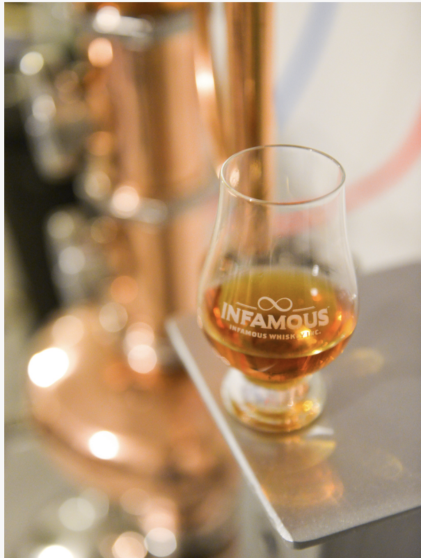
Infamous Whiskey's Experimental Batch Still

Infamous Whiskey's Distilled Spirits Plant permit number is DSP-GA-20139