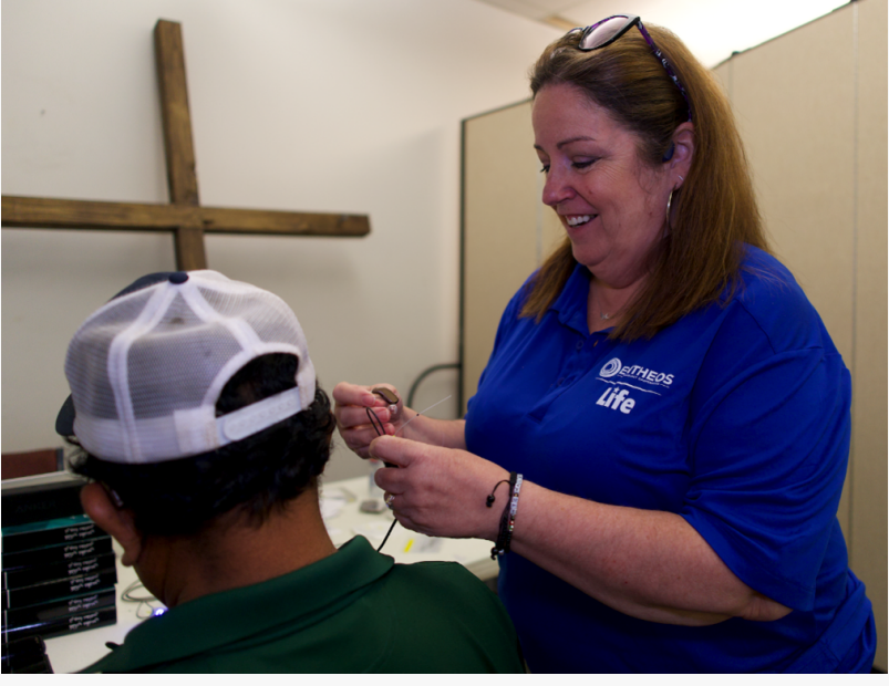
Hearing the Call in Texas