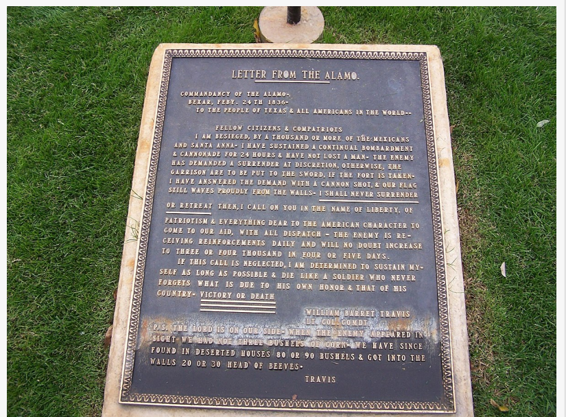
The most famous letter in Texas History.