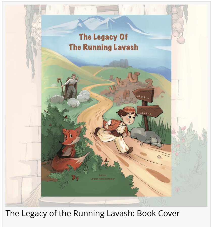
The Legacy of the Running Lavash: Book Cover

Coinciding with the 10th anniversary of UNESCO's recognition of lavash-making as an Intangible Cultural Heritage of Humanity, this book offers young readers aged five and up a unique window into Armenian traditions, language, and customs.