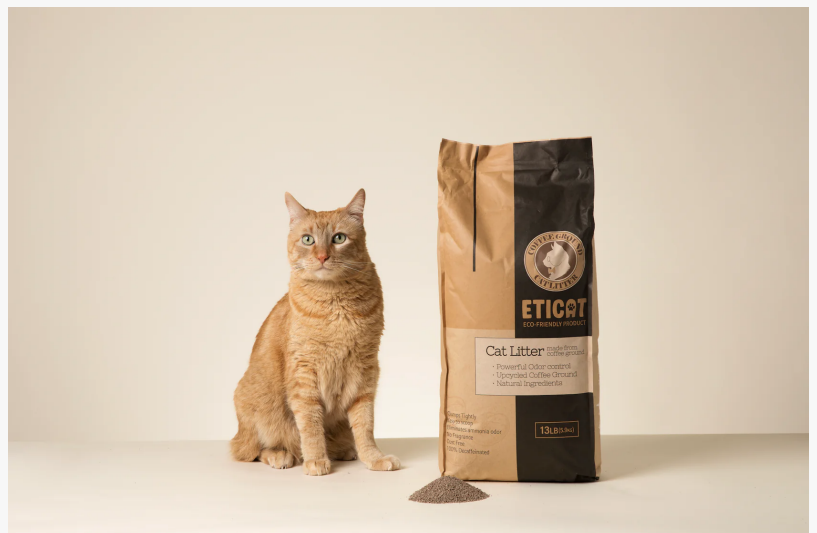
Promotional image of Eticat