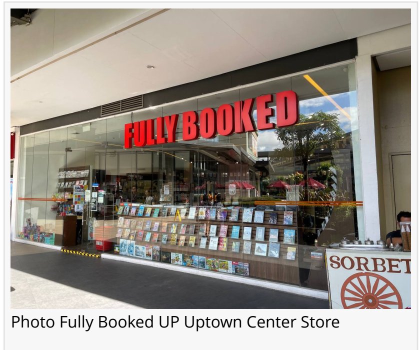
Photo Fully Booked UP Uptown Center Store