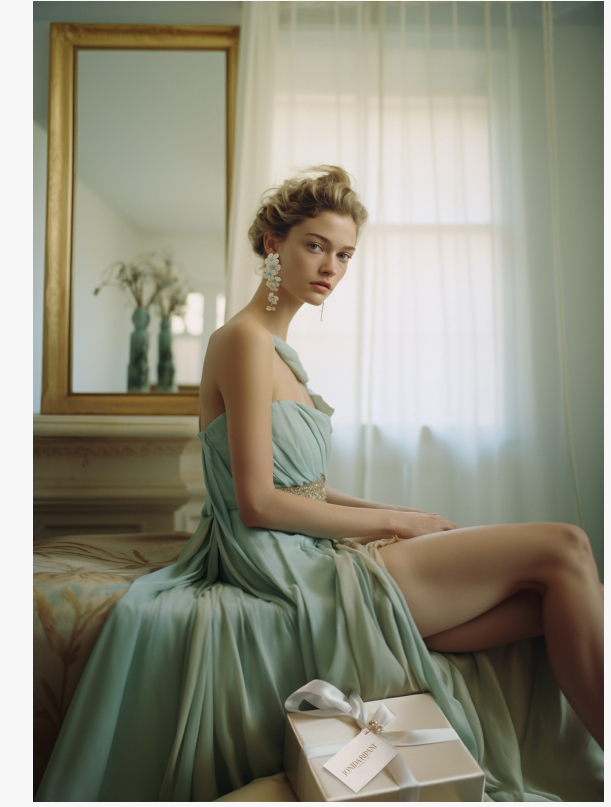
Jonida Ripani floral earrings

The 2024 collection showcases Jonida Ripani's ability to evolve with bridal fashion trends while maintaining the brand's signature elegance and attention to detail. From delicate lace appliqués to bold, sculptural elements, each piece in the collection offers brides a chance to express their personal style on their special day.