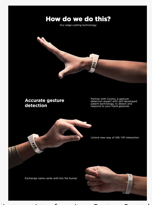
Showtime consists of a unique Gesture Control Function