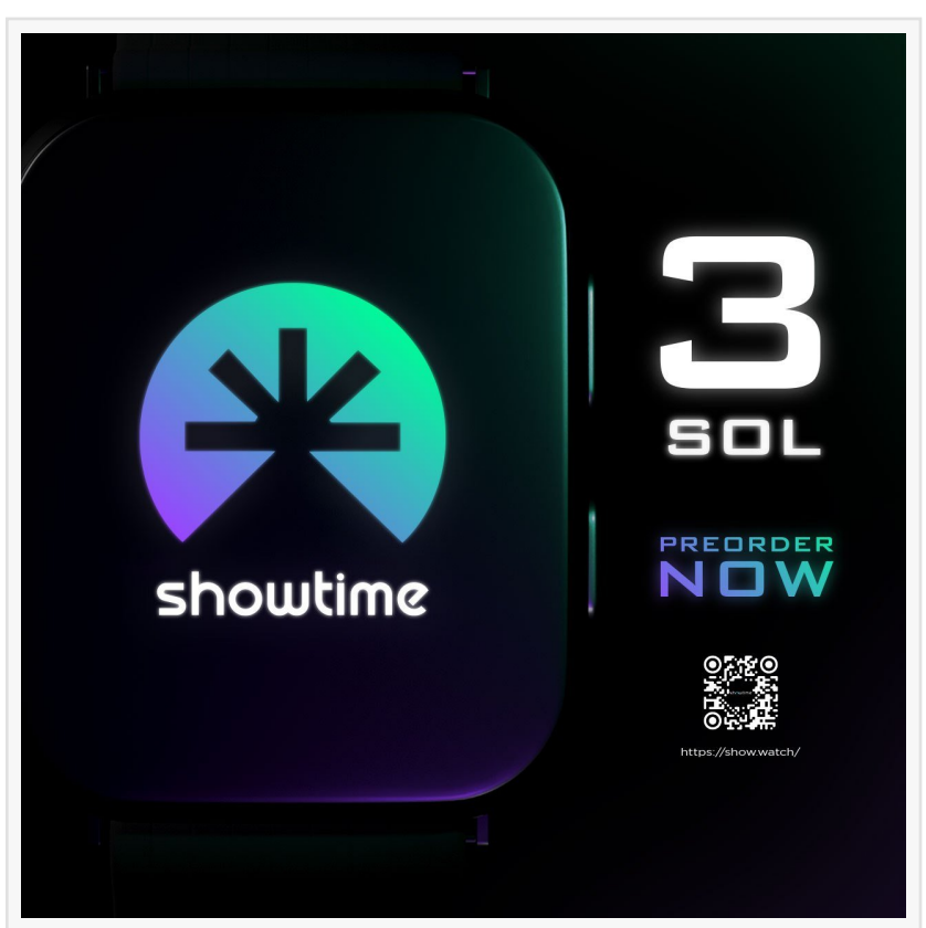
Showtime Watch is currently priced at 3 $SOL.

3 | Blockchain Synergy: A New Way of Storing and Sharing Data At Hetaro Labs, we understand the importance of privacy and data ownership. Showtime Watch secures your personal data on the Solana blockchain, giving you full control over what data you share. Partnering with PublicAl, we ensure that your data remains private and you get rewarded for sharing it. This commitment to data security and ownership sets Showtime Watch apart in the wearable tech market.