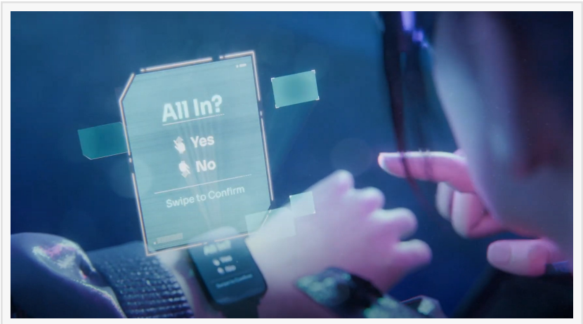
Showtime Watch - Your Al & Web3 Companion

2 | Solid Technologies: Active Al Companion, Gesture Identification, and Extended Reality Showtime Watch is not just a smartwatch; it's your ultimate active Al companion. With ShowAl, our advanced artificial intelligence, the watch processes data from multiple perspectives to deliver optimal responses tailored to your needs. Imagine receiving personalized recommendations for local events, alerts for thrilling airdrops curated to match your risk preference, or swapping tokens seamlessly with Al