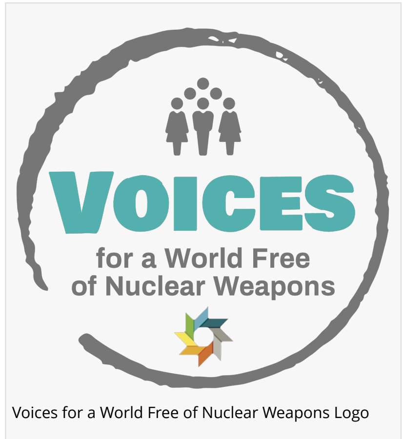
Voices for a World Free of Nuclear Weapons Logo

Voices for a World Free of Nuclear Weapons' purpose statement: "We invite all people of good