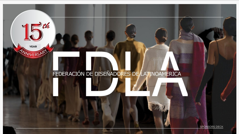
FDLA Celebrates 15 Years of Fashion

Celebrating 15 Years in the industry Elevating Latin America Fashion Designers and emerging brands, FDLA is pleased to introduce a new era in fashion providing opportunities to several young fashion designers and emerging talents the New Ones to Watch.