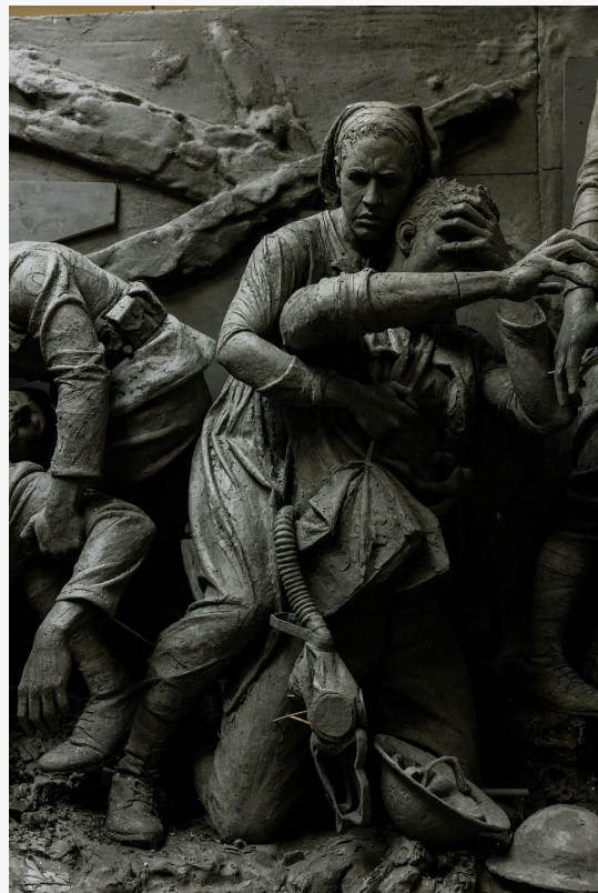
Sabin Howard Cost of War nurse

This press release can be viewed online at: https://www.einpresswire.com/article/733095677