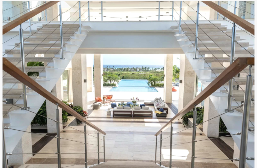
Luxurious mansion in Cap Cana up for auction by G3 Auctions

The deadline to bid on Villa Parthenope is August 20th at 5 p.m.. This auction is part of G3's $460 million Tropical Getaway Summer Auction Event. For more information, or to receive the auction bidder information packet, please visit G3auctions.com or call 1-678-333-3000.