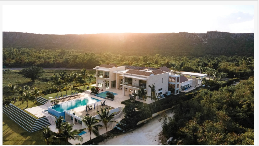
Dominican Republic luxury home offered at auction by G3 Auctions